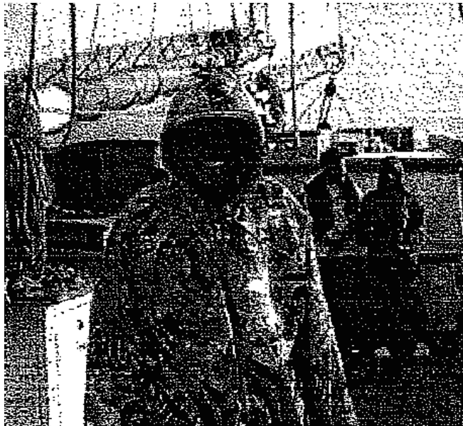
An Urban Teacher World participant enjoys an excursion aboard the Denis Sullivan schooner.

"We wanted to give them a lot of different opportunities that will encourage them to stay in school and continue their education as young adults," he adds.